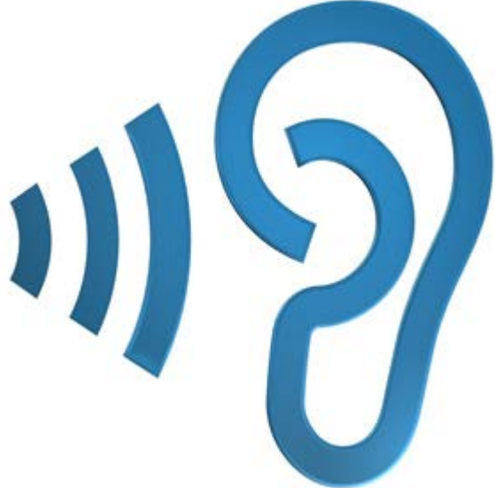
Analyze Real Time Network Traffic