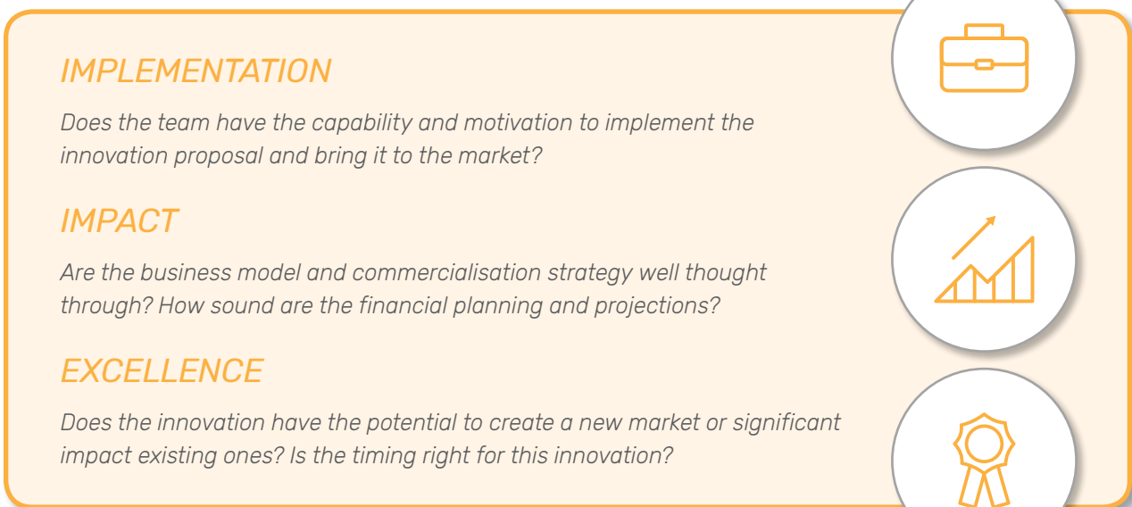
Figure 1: Three criteria to assess

The jury evaluates the participating SMEs according to three main criteria: Implementation, impact and excellence.