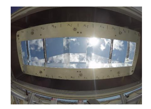
Solight Industrial Collector Tel-Aviv Installation